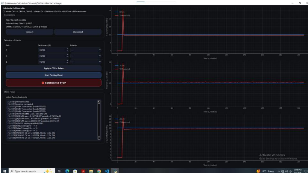
Continuous hold test

Provides a stable and constant magnetic field along selected axes for extended durations, enabling precise magnetometer calibration and bias estimation.