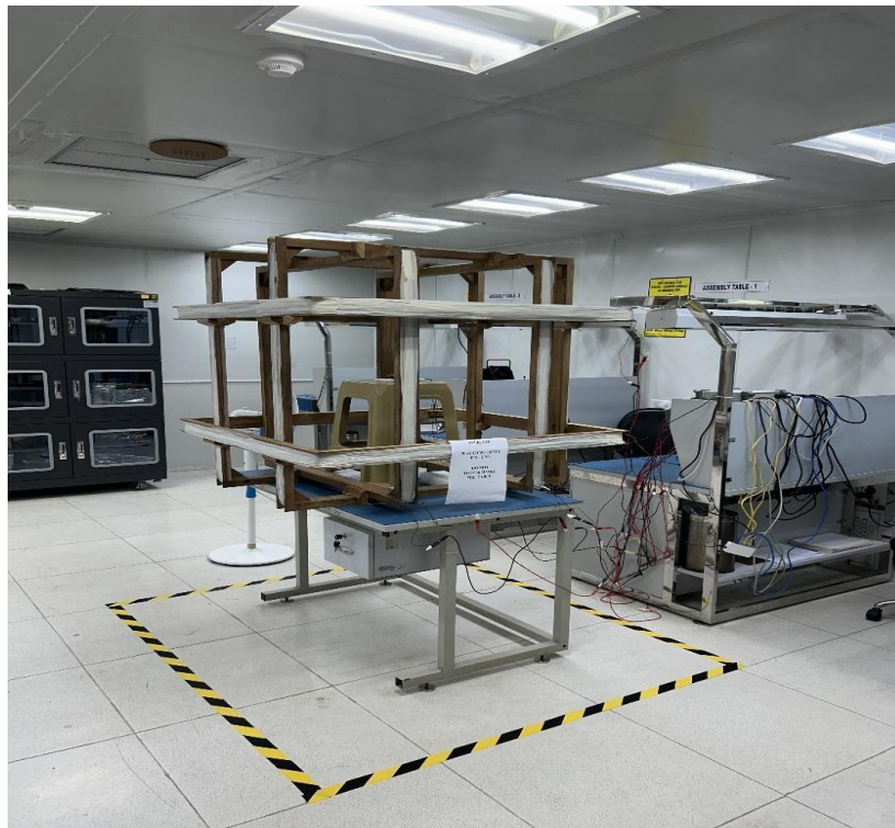
HOMS in clean room facility at AIDIN TECHNOLOGIES